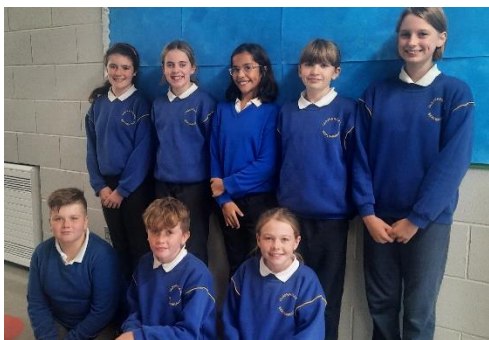
Green Schools' Committee

encourage and remind all pupils to bring rubbish home from their lunches to keep our waste in our school at a minimum. All classes are encouraged to be mindful about recycling, reducing waste and saving energy not only in school but at home too.